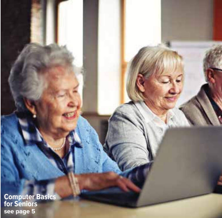
Computer Basics for Seniors see page 5