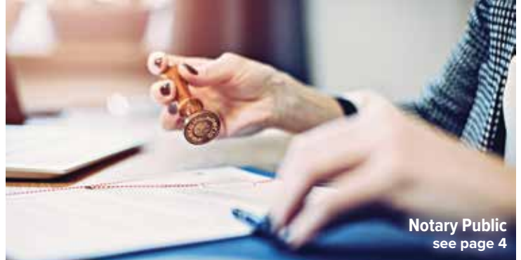
Notary Public see page 4