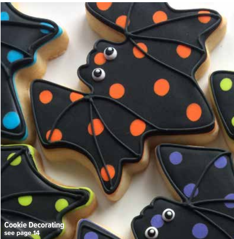
Cookie Decorating see page 14

with more than 100 career development and personal enrichment classes this Fall!