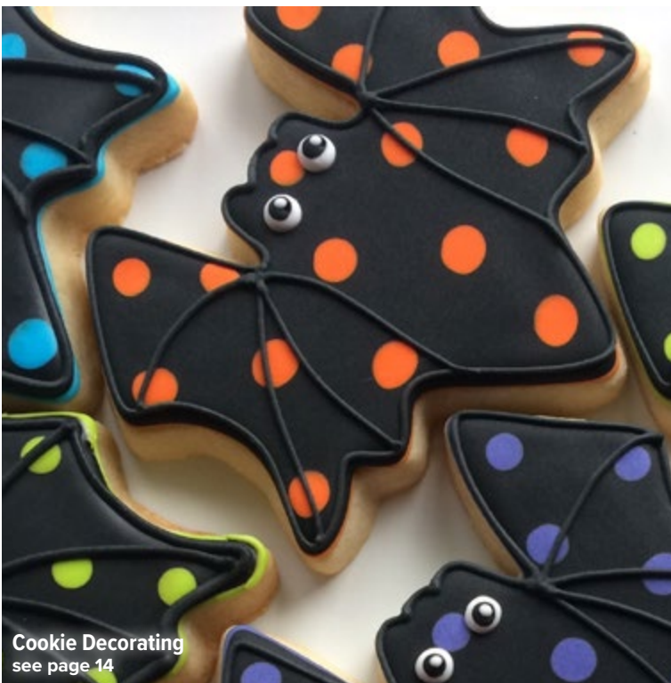
Cookie Decorating see page 14

with more than 100 career development and personal enrichment classes this Fall!