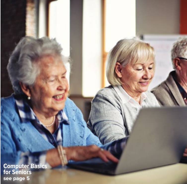
Computer Basics for Seniors see page 5