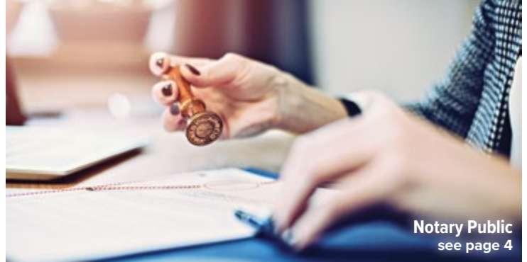
Notary Public see page 4